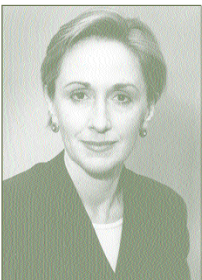
Hon. Carla E. Craig Chief Judge U.S. Bankruptcy Court E.D.N.Y.